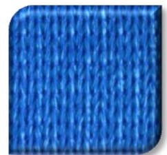
648 Ocean Blue