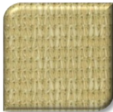
121 Desert Sand