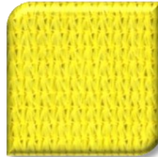
810 Sunshine Yellow