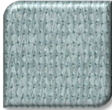
403 Alpine Silver