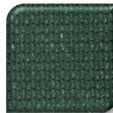
580 Forest Green