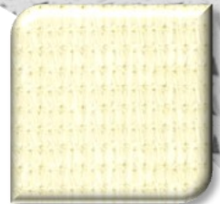
499 Coastal Cream