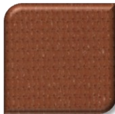
496 Canyon Tan