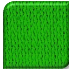
362 Meadow Green