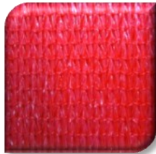
199 Lava Red